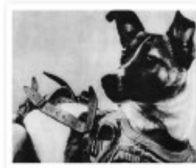
First animal in space (USSR) Laika the dog November 1957