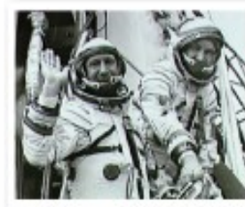
First spacewalk (USSR) Alexey Leonov March 1965