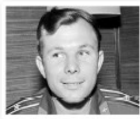
First human in space (USSR) Yuri Gagarin April 1961