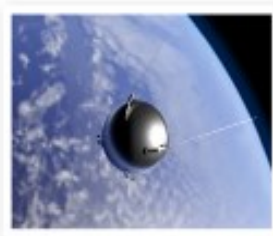
First satellite in space (USSR) Sputnik 1 October 1957

The Space Race was a competition between the Soviet Union (USSR) and the United States that took place in the 1950s and 1960s when the two countries were involved in a war called the Cold War. The main aim of the Space Race was to go into space and reach the Moon first. President of the United States, John F Kennedy, famously declared, 'We choose to go to the Moon!' By the end of the decade, both the USSR and the USA had invented the technology to make it possible. There were many exciting firsts during the Space Race.