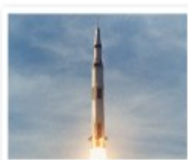
First manned spacecraft to orbit the Moon (USA) Apollo 8 December 1968