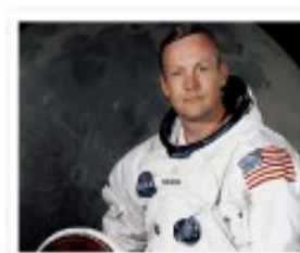
First person to step on the Moon (USA) Neil Armstrong July 1969