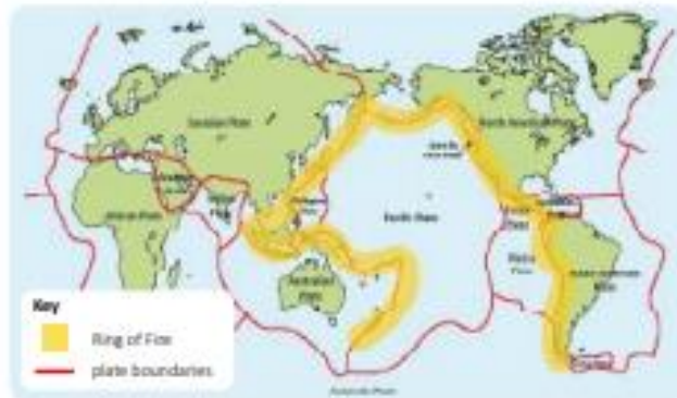
Earth's tectonic plates

The tectonic plates that make up the Earth's crust float on top of the mantle and are constantly moving. The places where tectonic plates meet are called plate boundaries. Tectonic plates can push together, pull apart or slide against each other. This movement at the plate boundaries can cause volcanic eruptions, earthquakes and tsunamis.