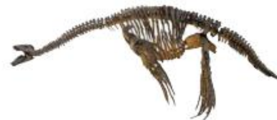
fossilised Plesiosaur skeleton

Mary Anning (1799–1847) was an English fossil collector. She lived in Lyme Regis in Dorset, in an area now known as the Jurassic Coast. Mary had little formal education but was taught fossil hunting by her father. She made many important fossil discoveries during her lifetime, including an Ichthyosaurus fossil in 1811 and a fossilised Plesiosaur in 1823.