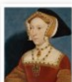
Jane Seymour (1508–1537)