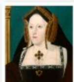
Catherine of Aragon (1485–1536)