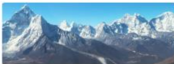
Himalayas mountain range

A mountain is a large, raised part of the Earth's surface. A mountain's highest point is called its peak or summit. Mountains are at least 610m in height. A mountain range is a chain of mountains that are close together. They are usually arranged in a line connected by ridges.